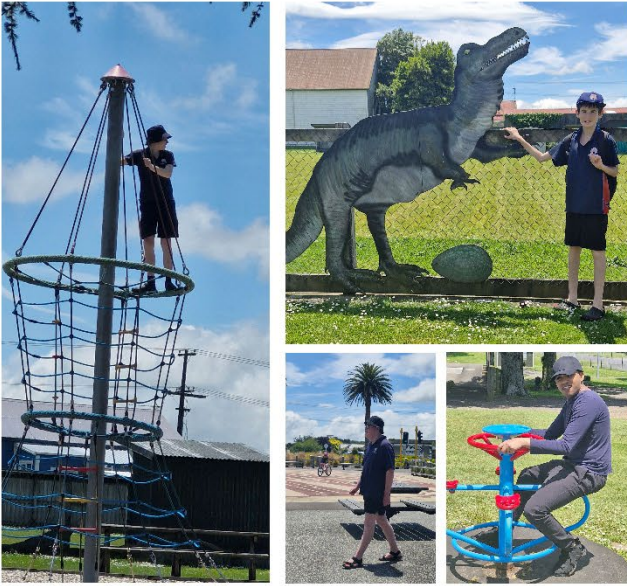
Endeavour Centre students enjoyed a week of fun activities.