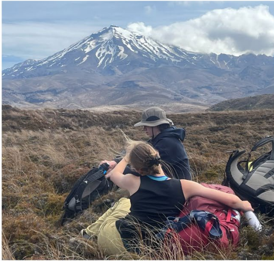
Oturere Hut, Tongariro Northern Circuit Walk. Taking in beautiful views on their four day tramp.