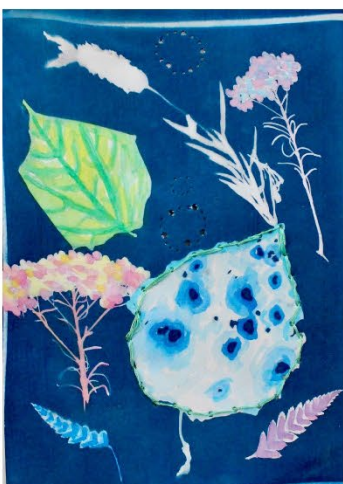
JAIDA REI - LEVEL 2 ART