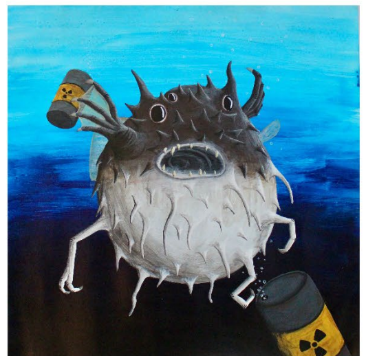
DANIEL MCCREA - LEVEL 2 ART