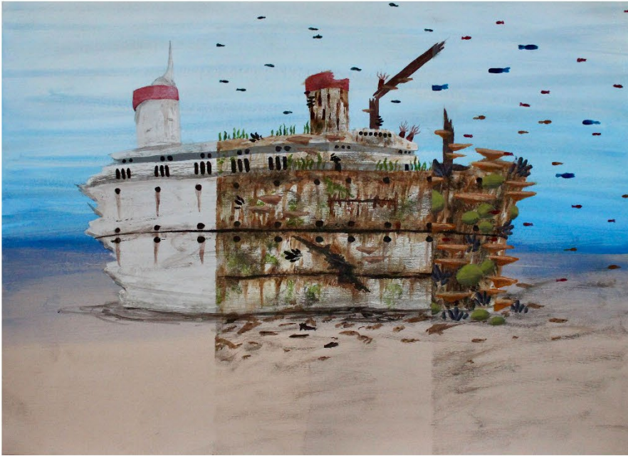
DANIEL MCCREA - LEVEL 2 ART