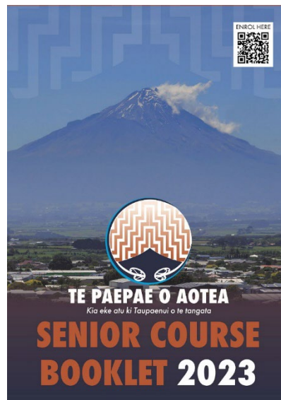
Senior Course Booklet

Check out our Website for all the information