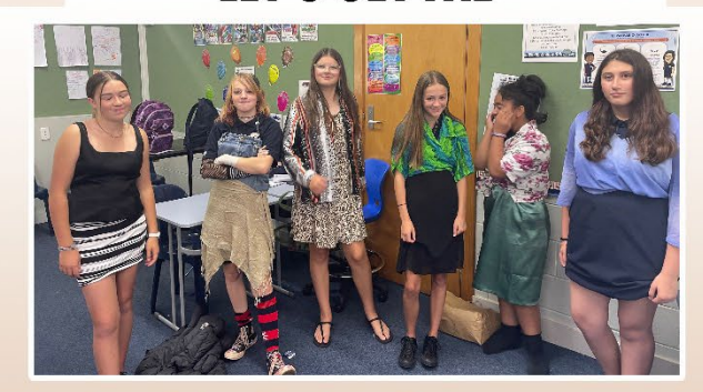
Let's get Fab - Op Shop Challenge to restyle second hand clothing items into new outfits.