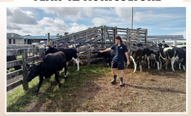
Stock Handling for Year 12 Agriculture at the Egmont Showgrounds. Students had a great learning experience in glorious weather.