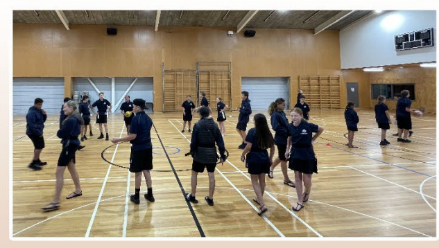
Tuakana Teina in Event Volunteering. Student created their own lessons and then taught their group how to play.